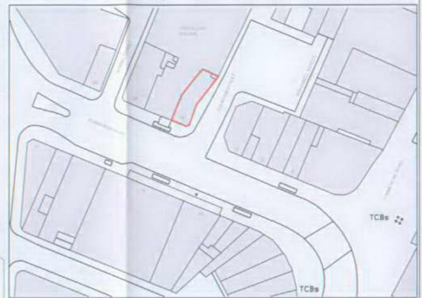
LOCATION PLAN (A1 1:500/ A3 1:1000)